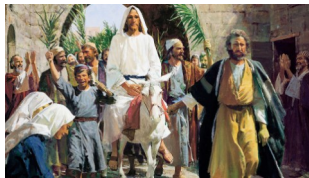
Holy Week Begins

There will be no mass at St. Teresa's on this date so that everyone may attend this celebration.